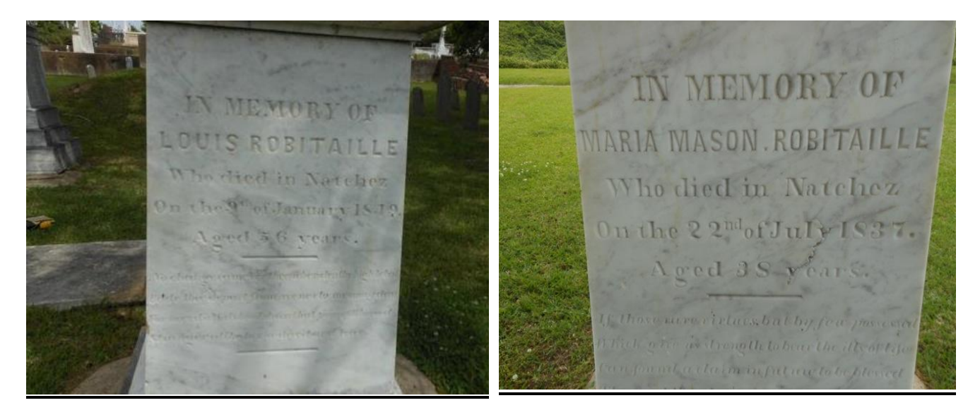
Figure 12- Louis (fils) Robitaille grave stone