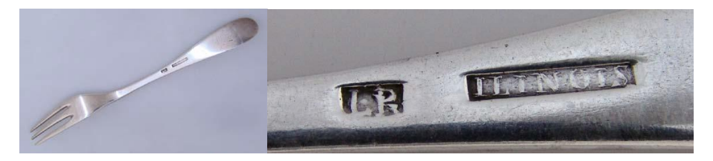
Figure 9- Louis Robitaille fork bearing "Ilinois" marking

It has been said that Louis Robitaille also made a set of six spoons for the Vallé family and an engraved ladle for Julie Beauvais of Kaskaskia.<sup>70</sup> Additional tableware made by Louis Robitaille, such as fork shown in Figure 9, spoons, and ladles have occasionally appeared in private sales. It is likely Louis made more silverwork than what is shown here while he was in Sainte-Geneviève, but to date, the author has not found substantiating paperwork or illustrations to prove this.