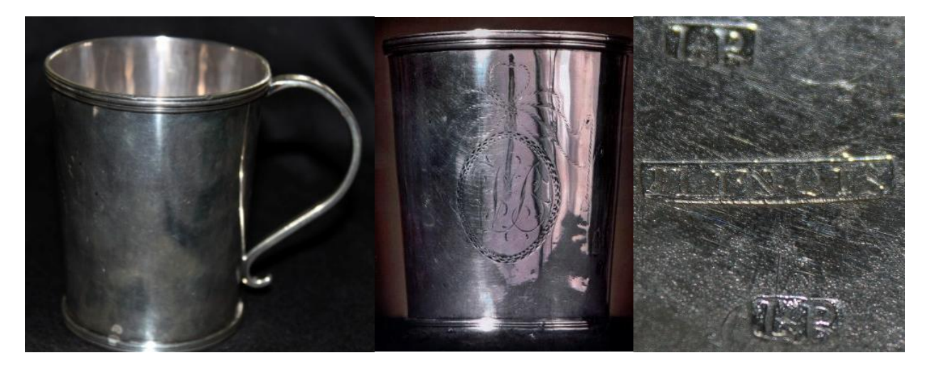
Figure 8- Handled silver drinking cup made by Louis Robitaille for Vital Beauvais St. Gemme